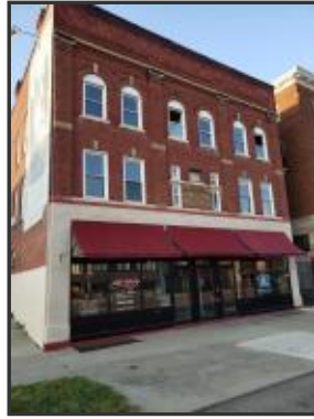
A 76 W. Main Bldg Ext.